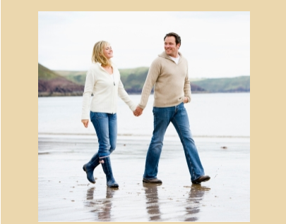
Open communication and teamwork are especially important when it comes to saving and investing for retirement.